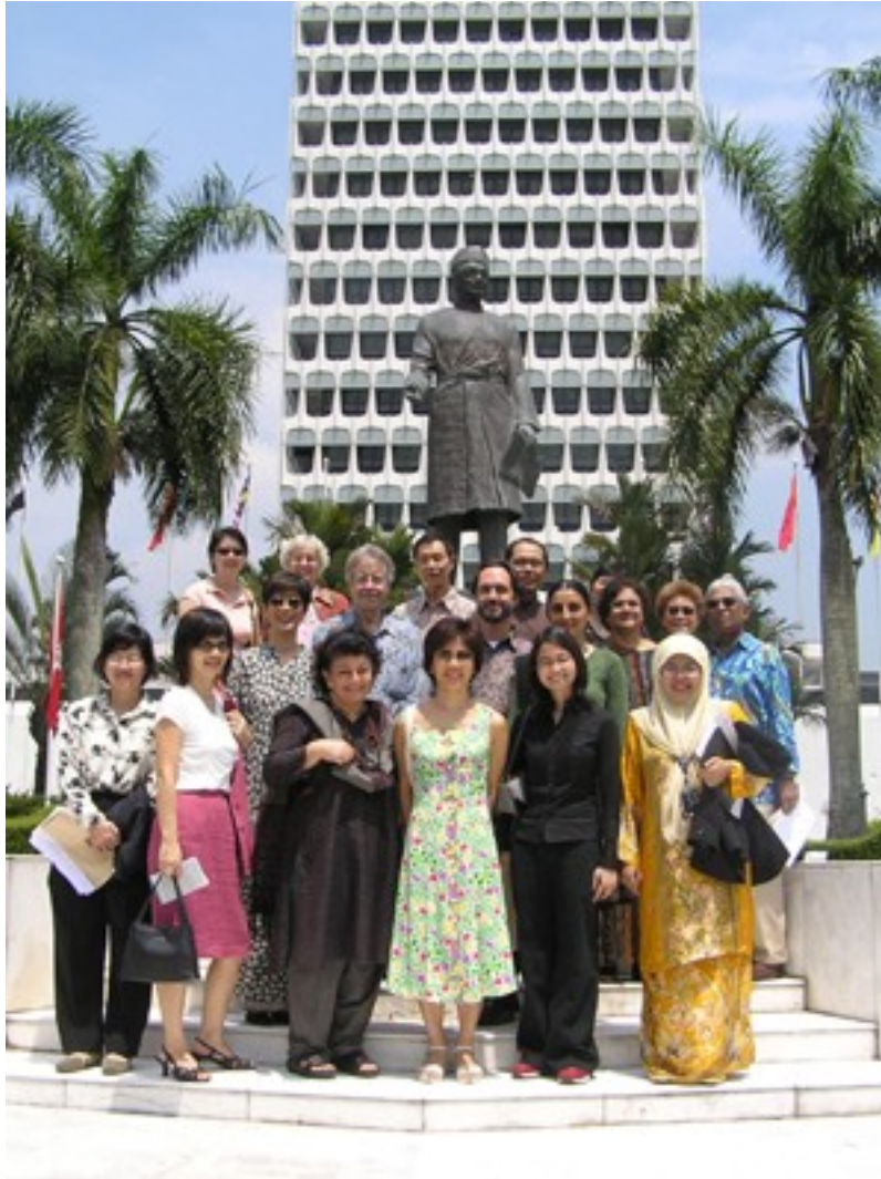
Merdeka Legacy Series: Visit to Parliament House

2 Jalan Stonor, 50450 Kuala Lumpur, Malaysia tel +60 (0)3 21449273 fax +60 (0)3 21457884 heritage@badanwarisan.org.my www.badanwarisan.org.my